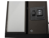
On/Off Switch with 100%/50% Dimming Color Temp. Switch: 2700K/3000K/4000K