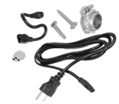
6' Power Cord 8' interconnect cable End-to-End connector Mounting screws