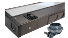
3/4" KOs Cable Connector Included